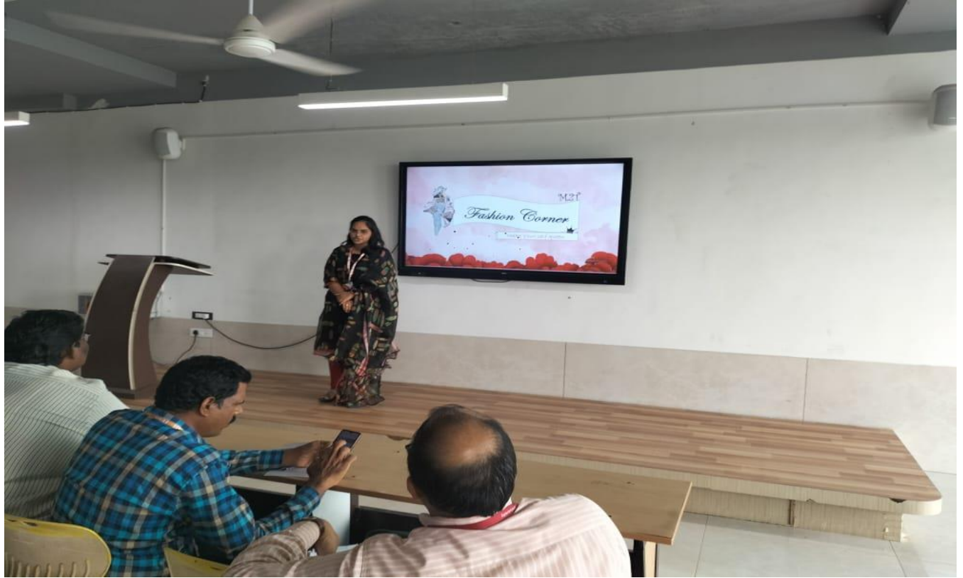
Pics: Professional society activity Startup Plan ON 31-05-2023