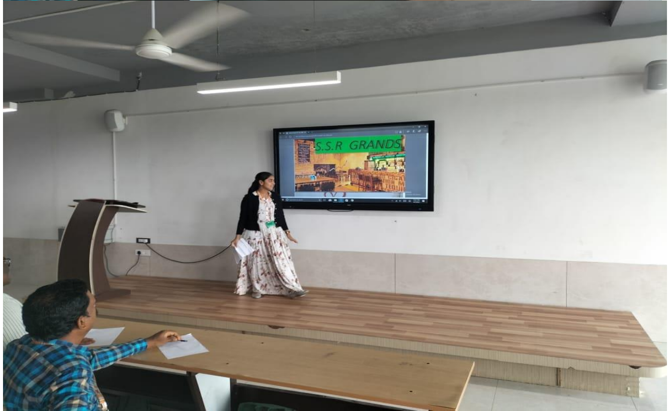
Pics: Professional society activity Startup Plan ON 31-05-2023