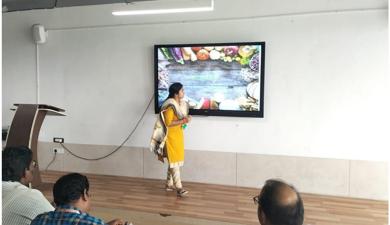
Pics: Professional society activity Startup Plan ON 31-05-2023